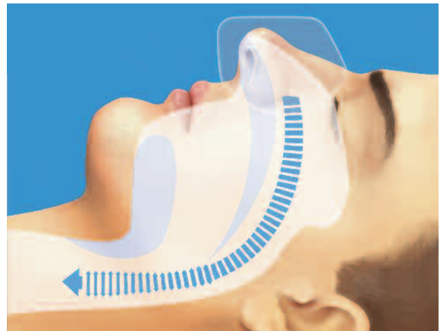
Positive airway pressure therapy