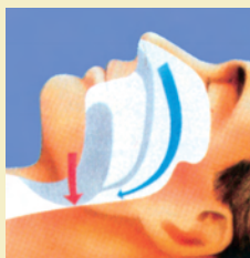
Obstructive Sleep Apnea

These pauses in breathing can happen 30 times or more per hour. When healthy sleep is interrupted in this way, the risk of developing cardiovascular disease and other serious health conditions may increase.