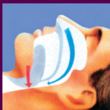
Obstructive Sleep Apnea